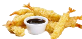
Shrimp in tempura. Size: 21/25 & 26/30