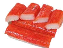
Surimi," maki sticks". 18 cm, red, (sushi).

Sales unit: 10*1 kg/box & 250 gr on a tray.