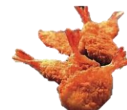
Butterfly Shrimp in Panko crumbs.