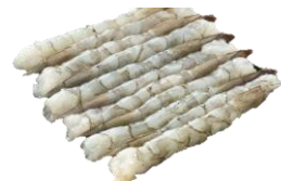
Nobashi shrimp. Raw Size: 4L, ASC.