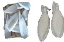
Cuttlefish whole. U1 Cuttlefish Torso. U-10&U-5