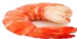
Argentine shrimp. Raw. peeled & HOSO.