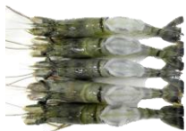
Tiger prawn. HOSO and whole boddy peeled.