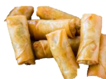
Spring rolls w/ duck. 20g./pcs.