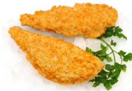
Breaded Cod in panko. Pre-fried. IQF.