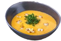
Lobster & Rock crab stock. 9 ltr. In bucket