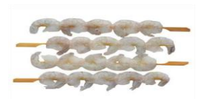
Tiger prawn skewers 100 g