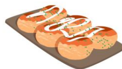
Takoyaki balls, Octopus balls "Japanese street food"