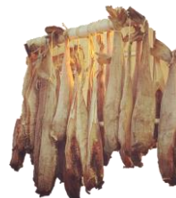
Dried Cod HG.