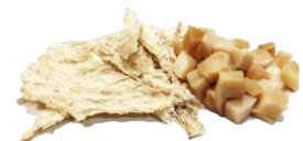
Shark- fermented & Dry fish. Skin&boneless.