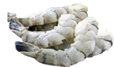
Tiger prawn PDTON. Peeled tail on Size: 21/25 & 16/20.